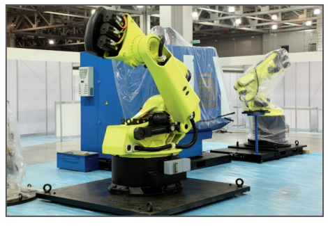
Automotive Robot Controller

Pulp and Paper Food and Beverage Mining and Metal