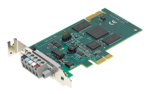
DN4 DeviceNet PCle Card Series 112113